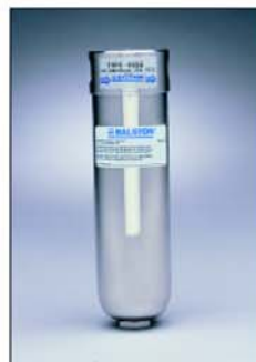
Types 33S6 and 45S6

LP-Type cartridges with integral prefilters are recommended for filtration of all liquids with high solids content, including samples from cooling water, ground water and effluent streams.