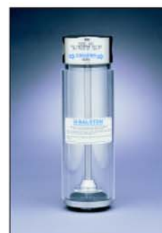
Types 33G and 45G